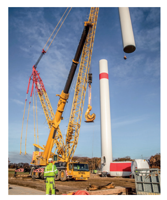
Wind farm Gross Niendorf

In the past few months the following wind farm project transactions have been closed: Beginning of July the wind farm Schüblingsen in the Uckermark in Brandenburg has been purchased. The wind farm consists of one Vestas V112 with a hub height of 140m and 3.3 MW and a Vestas V126 with a hub height of 137m and 3.3 MW. The commissioning took place in of January 2019.