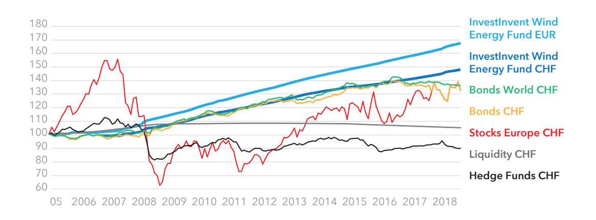
Risk - Return profile since Launch annualized (per year)